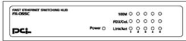
FX-05SC Front View